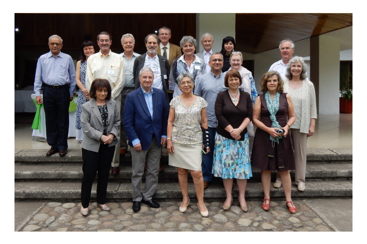
IAU EC Members and Division Presidents at the EC98 Meeting in Mexico City

The 98<sup>th</sup> Executive Committee Meeting of the IAU took place between 4 and 6 May 2016 in Mexico City. It was hosted by the UNAM (Universidad Nacional Autónoma de Mexico) and was also attended by the Division Presidents. We present here an executive summary of the main items discussed and the decisions taken.