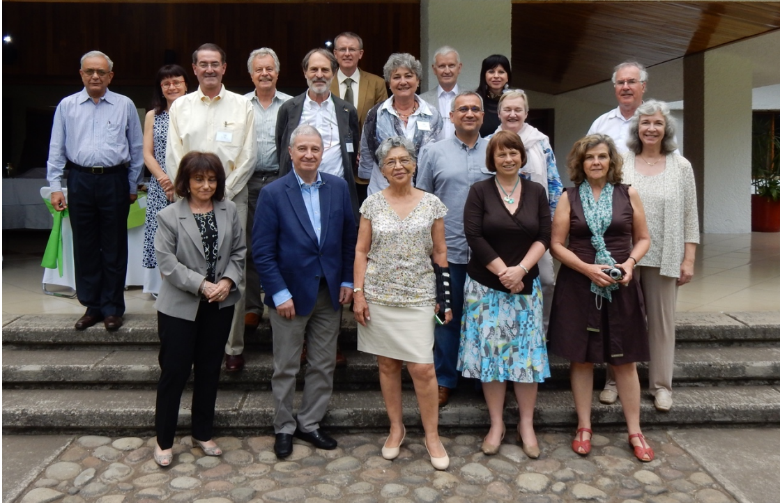
IAU EC Members and Division Presidents at the EC98 Meeting in Mexico City

The 98 th Executive Committee Meeting of the IAU took place from May 4 th to 6 th , 2016 in Mexico City, hosted by the UNAM (Universidad Nacional Autónoma de México) and was also attended by the Division Presidents. We present here an executive summary of the main items discussed and of the decisions taken.